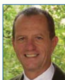
John C. Crittenden

Recognized for work on continuous-flow membrane filtration of plasma from whole blood; continuous-flow membrane plasmapheresis; theoretical models for flux and hemolysis; artificial pancreas.