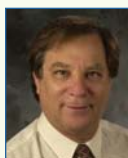
Jacob N. Israelachvili

Recognized for work in generalized Flory dimer theory and Hall-Helfand correlation function; simulation of amyloid fibrils formation.