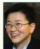
Jackie Y. Ying

Recognized for work on design and yield improvements of recombinant protein production; cell-free methods in developing patient-specific cancer vaccines, having so produced active complex hydrogenases enzymes; improved water filters based on the protein Aquaporin Z's ability to pass only water, possibly leading to highly selective biosensors