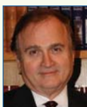
Nicholas A. Peppas

Founder of biomedical engineering. Pioneered use of films and surfaces in biomedical applications — rheological and clotting properties of human blood; polyethylene oxide as biomaterial; molecular transport across membranes; artificial kidneys, blood oxygenation and accompanying CO 2 removal during open heart surgery.